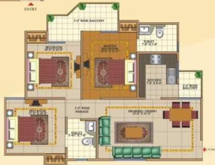
DWARKA-1 (3BR) Super Area : 1310 Sq.Ft.