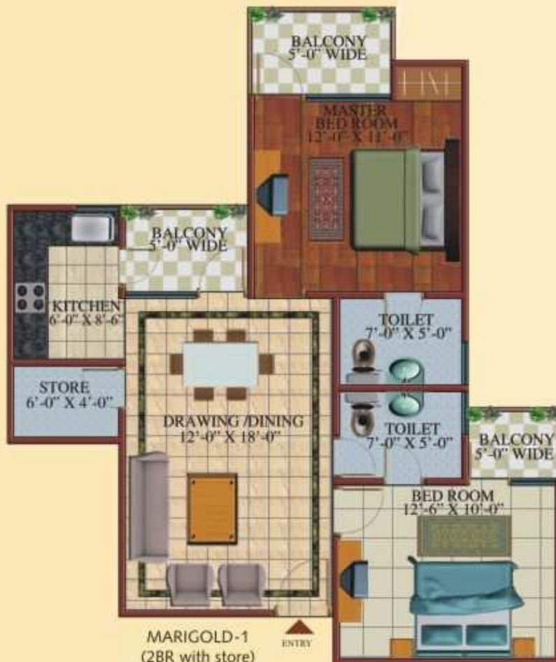
MARIGOLD-1 (2BR with store) Super Area : 1140 Sq.Ft.