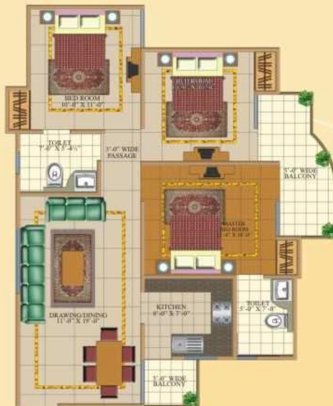
GOKUL-1 (3BR) Super Area : 1215 Sq.Ft.