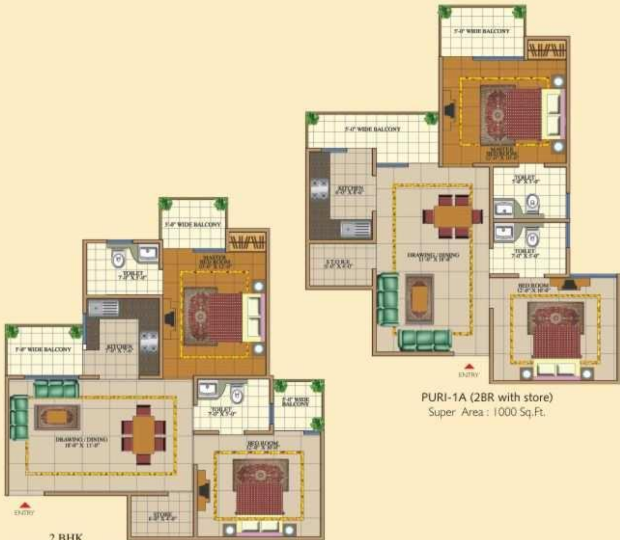
2 BHK PURI-1 (2BR with store) Super Area : 1000 Sq.Ft.