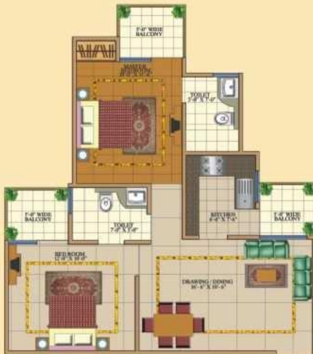
DWARKA (2BR) Super Area : 950 Sq.Ft.