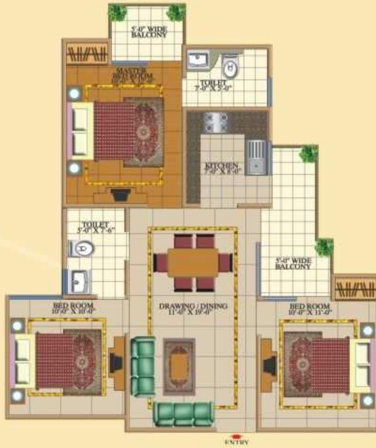
GOKUL-1A (3BR) Super Area : 1185 Sq.Ft.