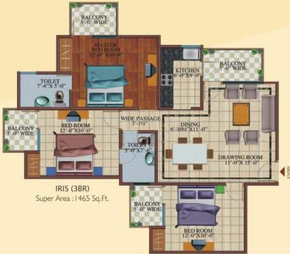
IRIS (3BR) Super Area : 1465 Sq.Ft.