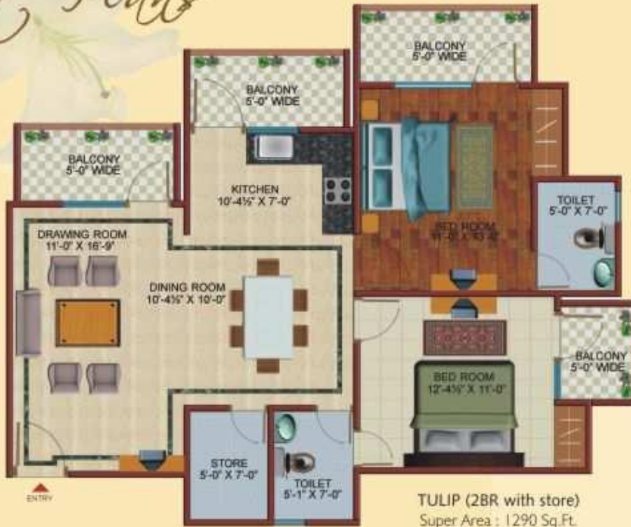
TULIP (2BR with store) Super Area : 1290 Sq.Ft.