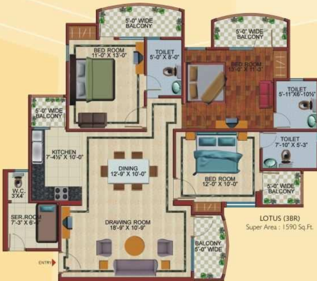
LOTUS (3BR) Super Area : 1590 Sq.Ft.